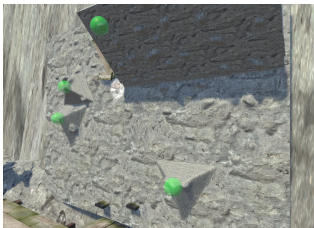
Figure 5: 3D Model of the climbing wall within the virtual environment. The spheres depict the calibration points.

Previous work and existing concepts can be categorized in this design space as depicted. The upper right and the lower left quadrant of the design space are so far left understudied. While applications that involve a form of virtual climbing in real environments are rather abstract, the combination of real physical climbing and immersive VEs promises interesting applications. Thus our goal is to explore this part. For this, our prototype system has to meet two main criteria: The user should be immersed in a VE while having the realistic physical impression of climbing. To meet these requirements, our system includes a head-mounted display (HMD) and an artificial climbing wall.