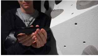
Figure 3: To register the physical wall with its virtual counterpart, the Vive controllers are used to set the position of the calibration points.