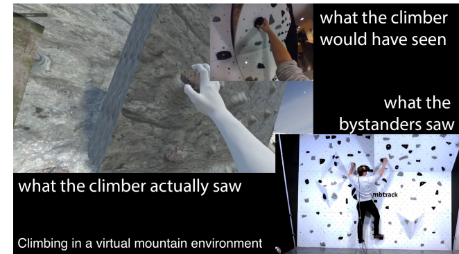
Figure 1: Visualization of the virtual reality climbing system. The integrated field camera of the HTC Vive was used to capture the view that the climber would have seen.

touches them. This feedback can drastically increase the user's sense of presence and enhance spatial learning [3].