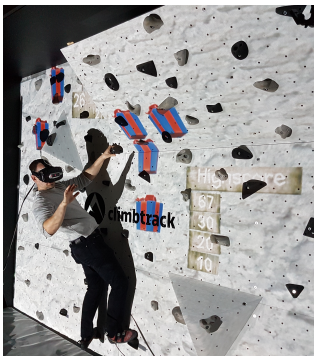
Figure 6: Using a projector, the virtual environment is projected back on the physical climbing wall to reflect the interactions of the player in the VE.

For the future, we plan to integrate the tracking of feet, followed by a formal user study. Albeit we did not experience any tangling of the wires of the HMD by the climbers, counter measures like the use of a wireless headset should be investigated.